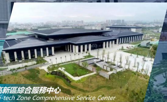
高新區綜合服務中心 Hi-tech Zone Comprehensive Service Center