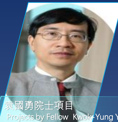
袁國勇院士項目 Projects by Fellow Kwok-Yung Yuen