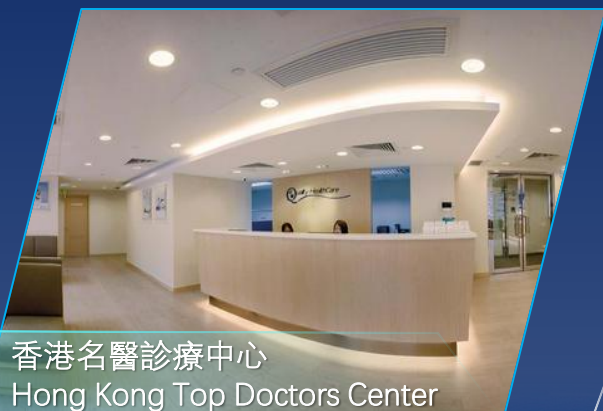
香港名醫診療中心 Hong Kong Top Doctors Center

Deepen Reform in Shenzhen-Hong Kong Cooperation