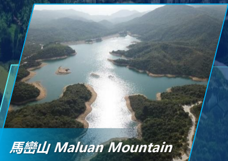
馬巒山 Maluan Mountain

全年PM2.5低於26微克/立方米 PM2.5 lower than 26 mg/m 3 in the whole year