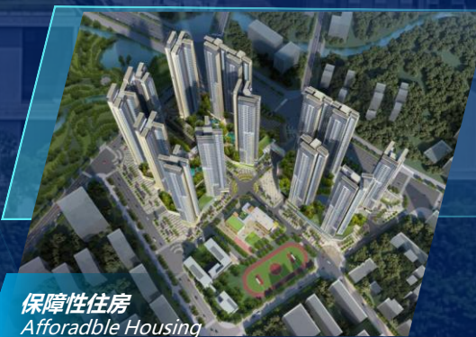
保障性住房 Affordable Housing