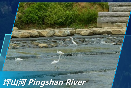
坪山河 Pingshan River