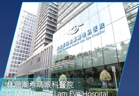
林順潮希瑪眼科醫院 C-MER Dennis Lam Eye Hospital