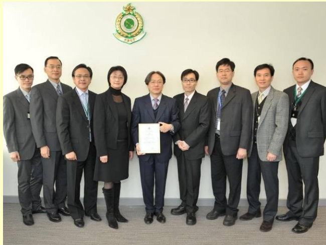
Award of AEO Certificate