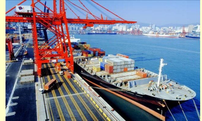
Electronic Manifest System (EMAN)