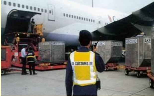
Air Cargo Clearance System (ACCS)