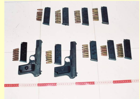
Control on Firearms