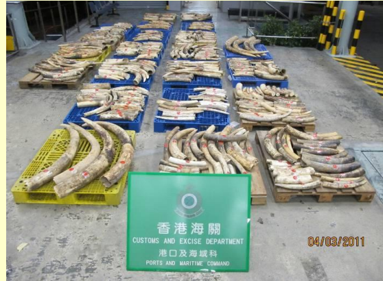
Protection of endangered species