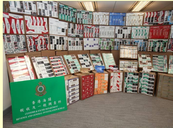
Seizure of Illicit Cigarettes