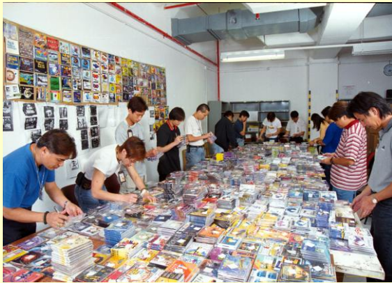
Intellectual Property Protection