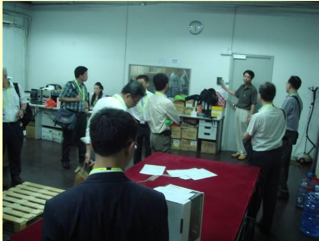
Conducting site inspection