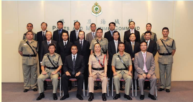
Cross-boundary Transportation Industry Customer Liaison Group on 10 Jan 2011