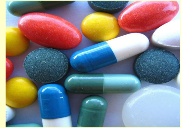
Control on Pharmaceutical Products