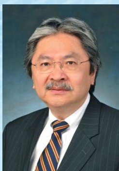
The Hon John Tsang Chun-wah, GBM, JP Financial Secretary 曾俊華先生 財政司司長